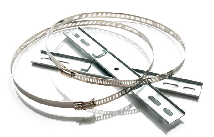
32 Way Distribution Box Pole Mount Kit

The Whyte Pole Mount Kits are suitable for indoor or outdoor use for use with the Whyte range of Fibre Distribution Boxes.