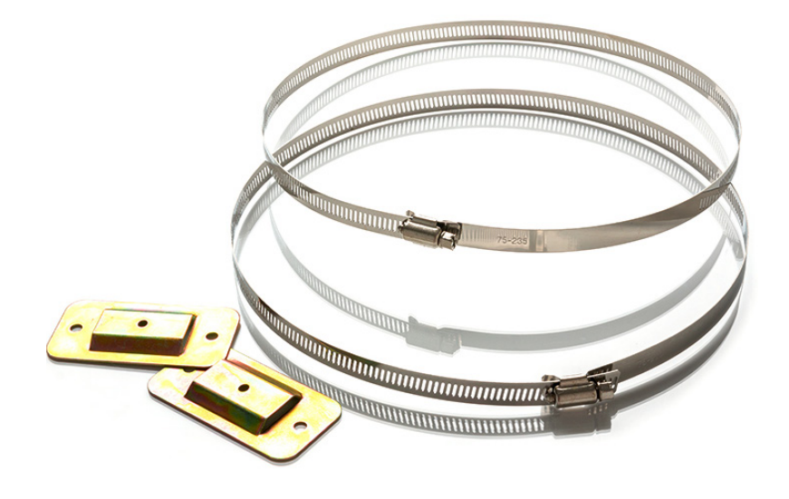
8 Way Distribution Box Pole Mount Kit