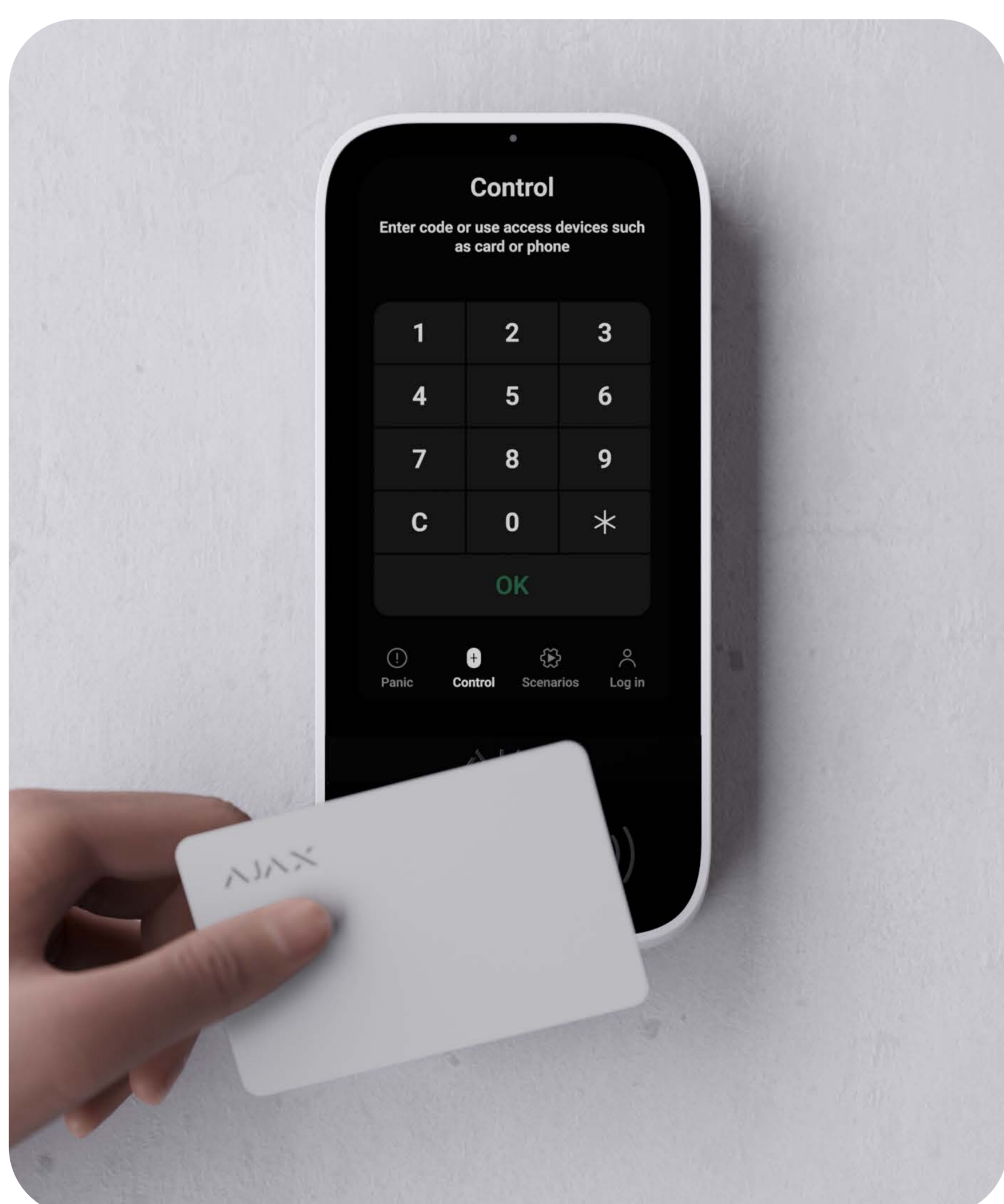
Pass card or Tag key fob