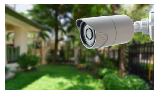
Trigger cameras and external lights (not included)