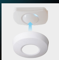
Ceiling mount cover