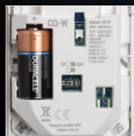
Automatic wireless setup