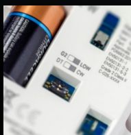
Laser etched instructions